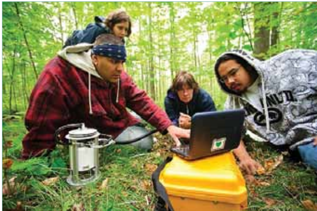
Students and staff measuring carbon dioxide escaping from the forest soil at Willow Creek.